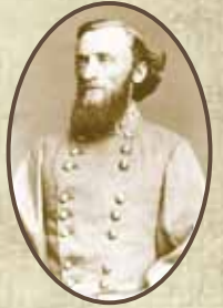
MAJOR GENERAL JOHN MARMADUKE