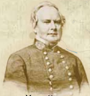
MAJOR GENERAL STERLING PRICE