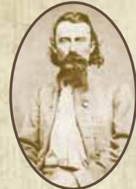
BRIGADIER GENERAL JOSEPH SHELBY