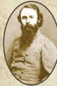
MAJOR GENERAL JAMES FAGAN